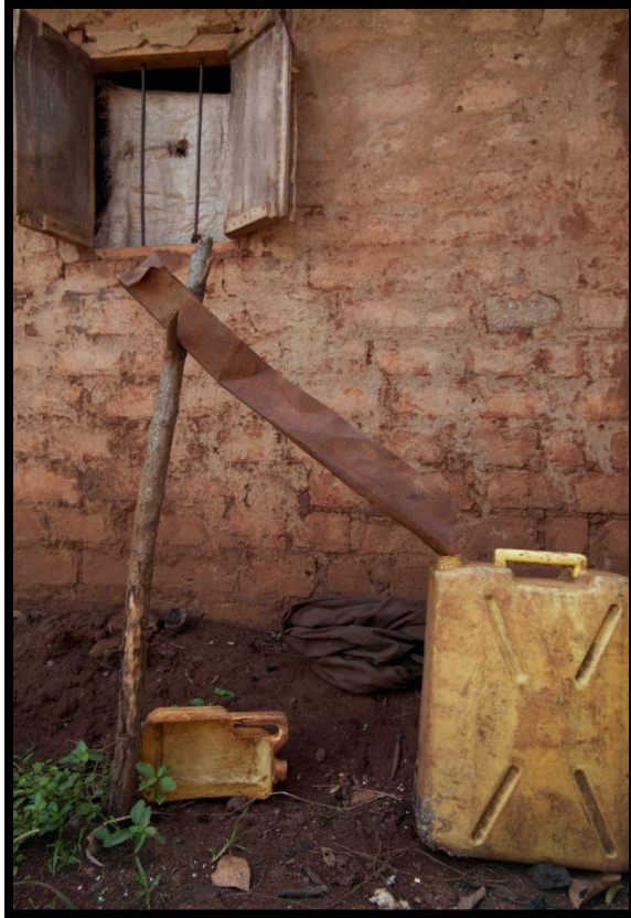
Image 3: Safe drinking water resources were very scarce in many areas of Wakiso, but thanks to your support of WaterCan's Gifts of Water campaign and a Government of Canada 1:3 match, this is slowly changing.