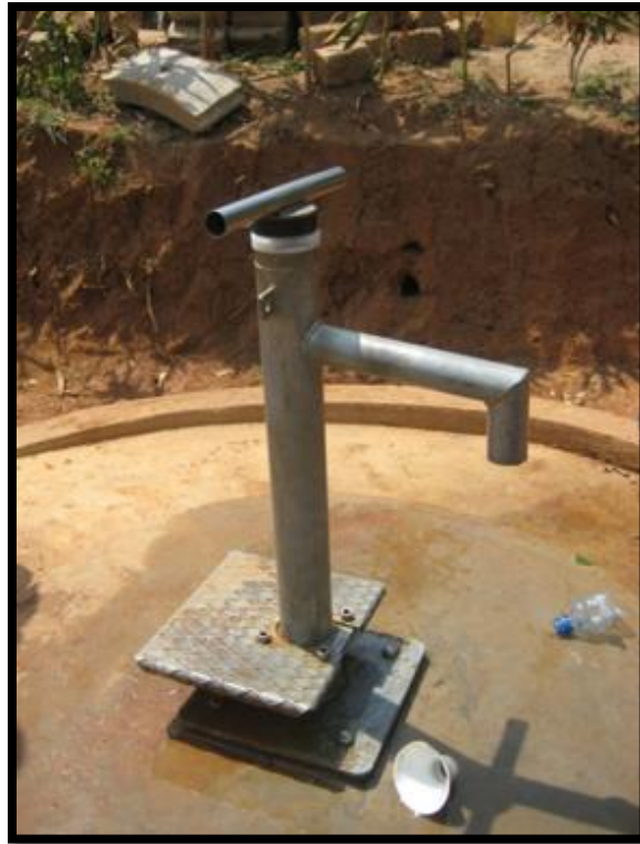
Image 9. Only locally-accessible and low-cost technologies are used so to ensure that operational and maintenance requirements for the new facilities are easily adopted by communities in Wakiso.