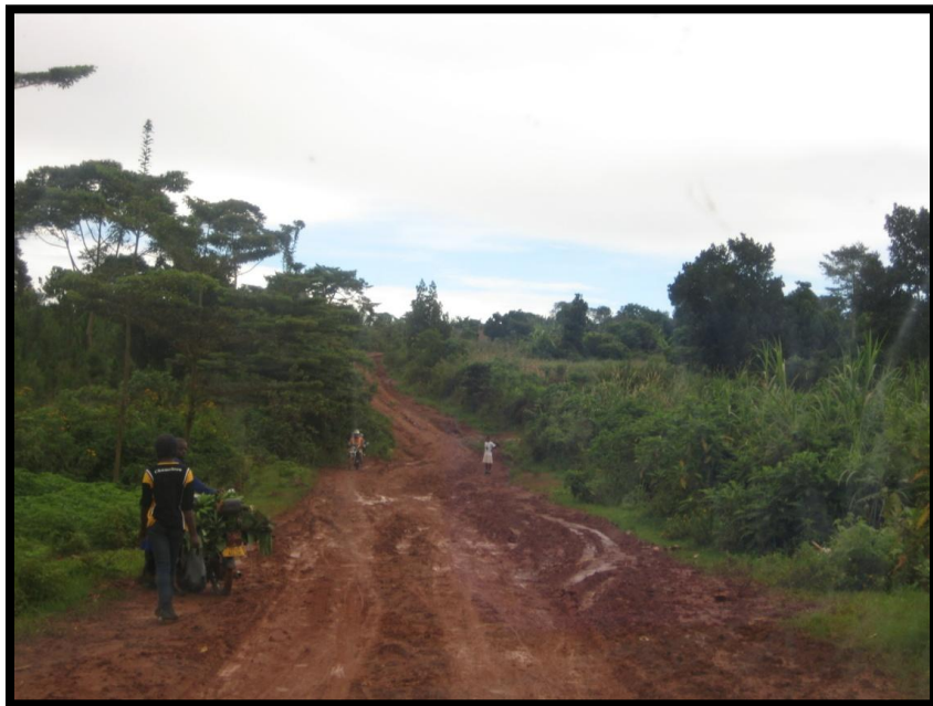
Image 1: Wakiso District is a peri-urban area encircling Kampala, Uganda's capital city. It is home to over half a million people.