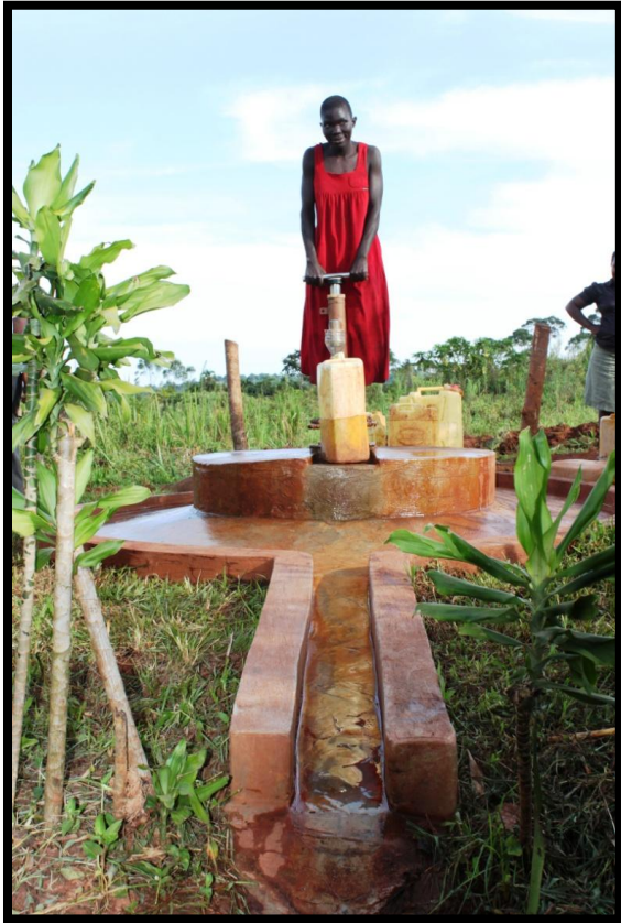
Image 8. A local resident at a new water pump in Nambitipa Village, Wakiso District, Uganda.