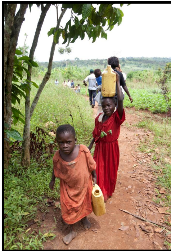
Image 6: Child and maternal health is also expected to improve dramatically in the region as a result of greater access to clean water resources.