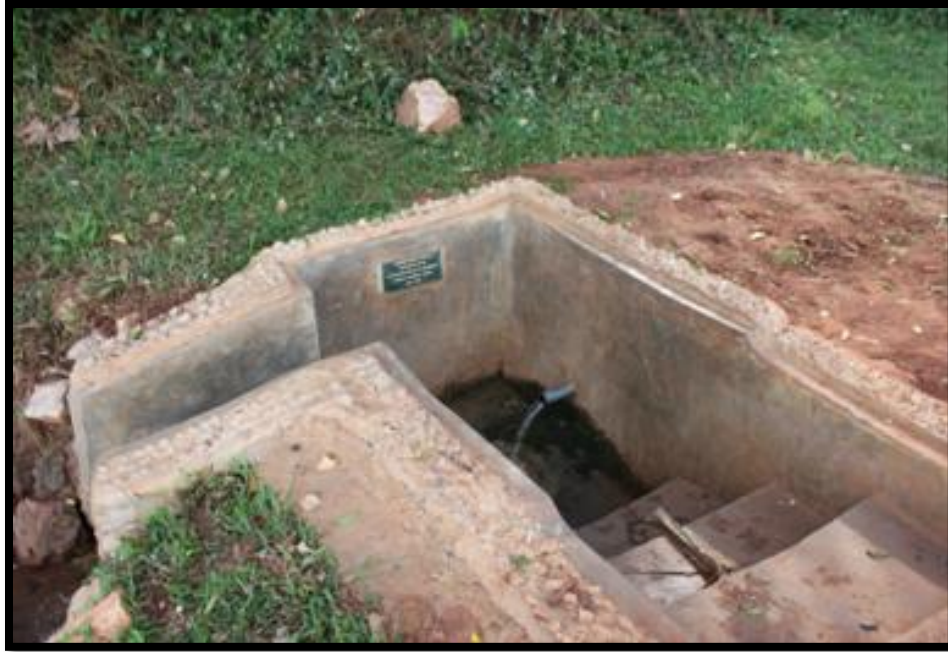
Image 11. The construction of the Wengeregeze Spring in Wakiso District, one of the four being constructed as part of the Gifts of Water 2010 project, is well underway.