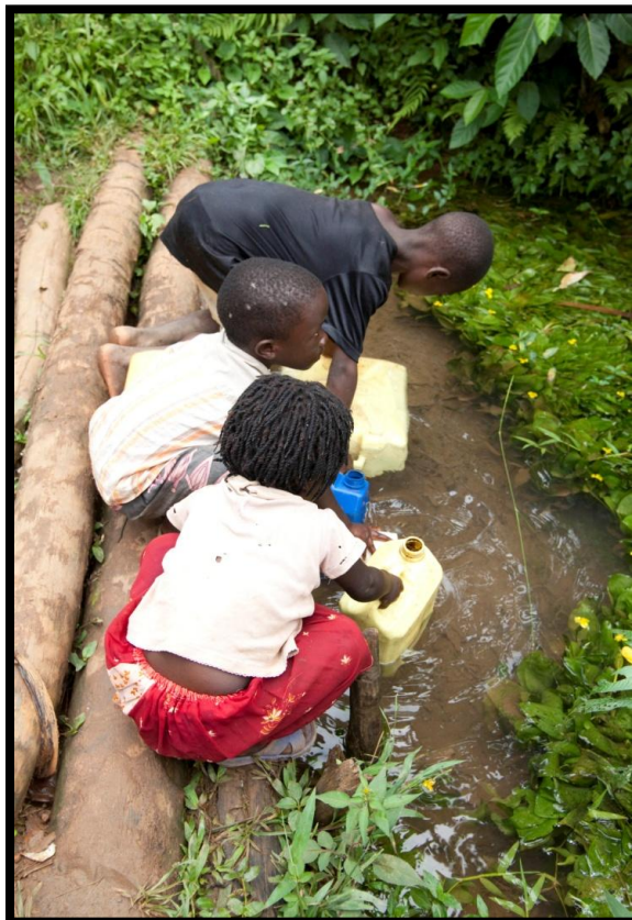
Image 4: For many, water drawn from rivers, lakes and streams was the only source of drinking water. Now, 15 hand-dug wells and 4 spring developments are under construction.