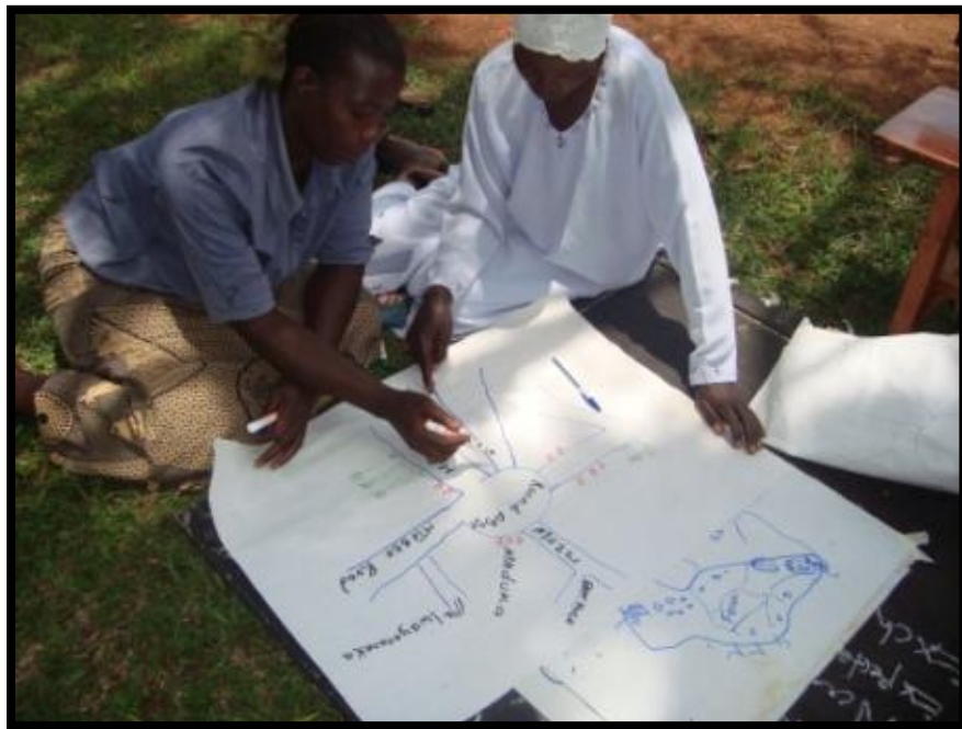
Image 10. Community participation is a key to the success of WaterCan's international projects. Here, community volunteers in Wakiso District are collecting important data to inform the construction of their local well.