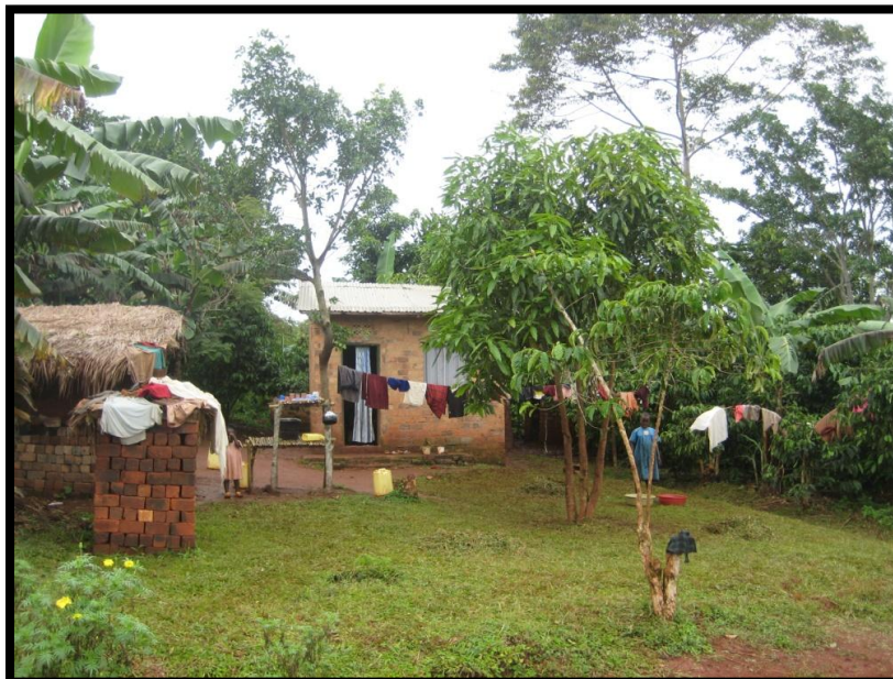
Image 2: During our Gifts of Water 2010 Christmas Campaign our dedicated supporters helped meet and exceed the campaign goal of $24,049 to bring clean water to Wakiso District.