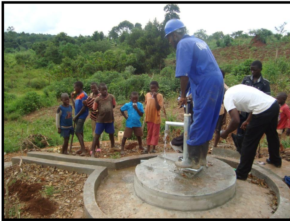
Image 12. A trained mason demonstrates use of the village pump to children in Nankonge Parish, Wakiso District.