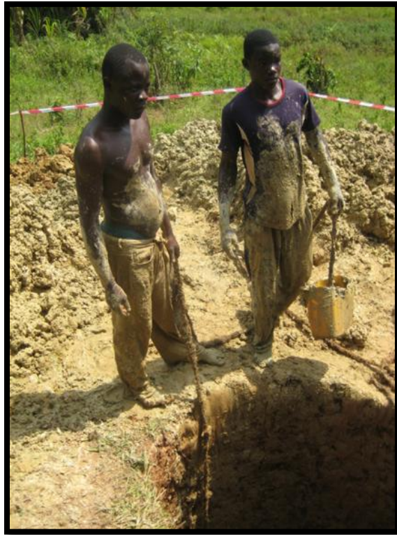
Image 7. Locally trained masons in the process of constructing a hand dug well, which can be up to 30ft deep.