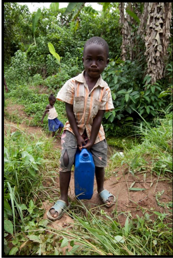
Image 5: The new water facilities will provide much needed clean water for 3,410 residents! This means that young children tasked with collecting water will be able to attend school instead.